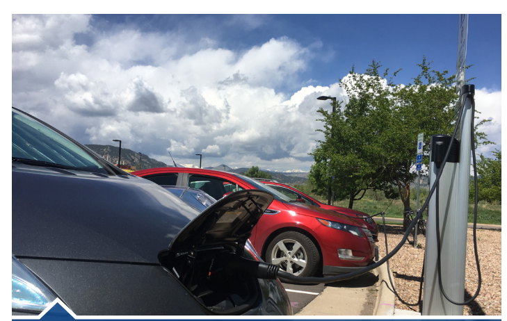
More fast charging stations are needed to encourage widespread adoption of electric vehicles.

Promote other clean modes of transportation like EV carsharing, electric buses and walking, biking and transit in order to encourage clean travel without requiring EV ownership.